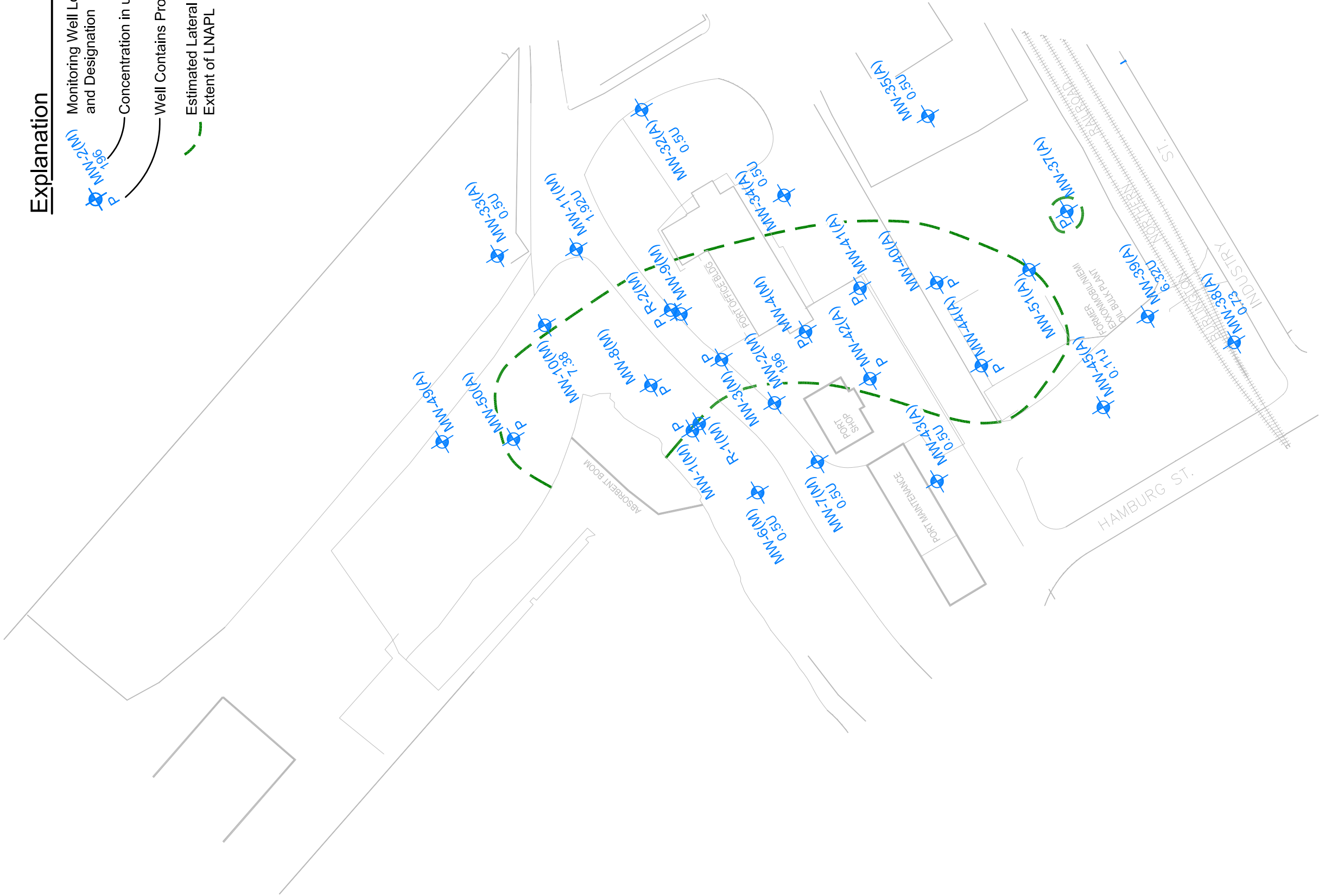
Key Plan - AOC 4