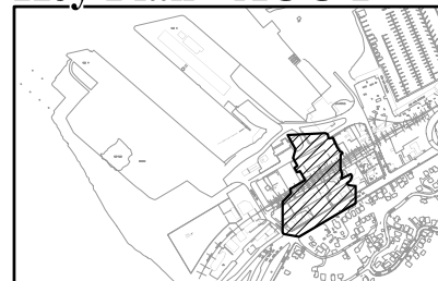
FIGURE 6-22 POTENTIOMETRIC SURFACE AOC 1 - JULY 19, 2004 Remedial Investigation/Feasibility Study Astoria Area-Wide Petroleum Site Astoria, Oregon